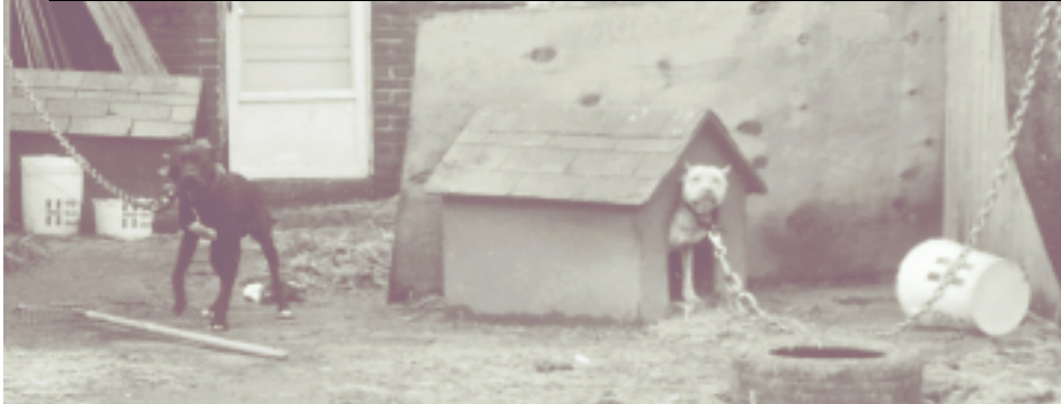
Washington Humane Society

If we tried to invent the cruelest punishment for dogs, we probably couldn't come up with anything worse than "solitary confinement."